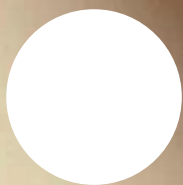
Conventional fiber cross section